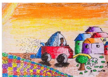
Oluwademilade David Odumuboni (Nigeria / Age 9)

My goal is to end world hunger. Waste Converter, sucks in waste from the road while moving and then converts waste to organic manure, which is then used to fertilize flowers and grow plants to produce fruits and food.