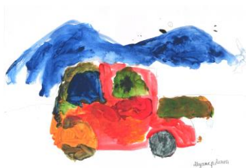
Amir Armanuly Mukhtar (Kazakhstan / Age 5)